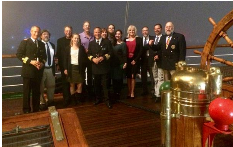
Solomons & Annapolis Table Brothers & Mates attended the Statsraad Lehmkuhl 2015 Diplomatic Reception