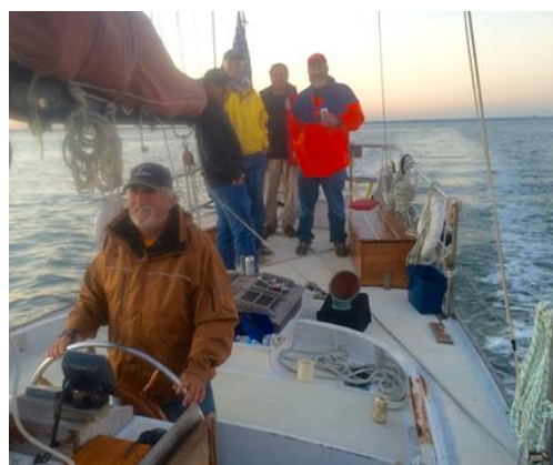
Chesapeake Brothers aboard Schooner Shanty