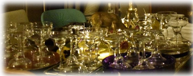
Glasses waiting to be filled!