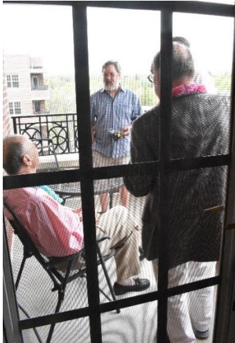
Brothers in Jail??