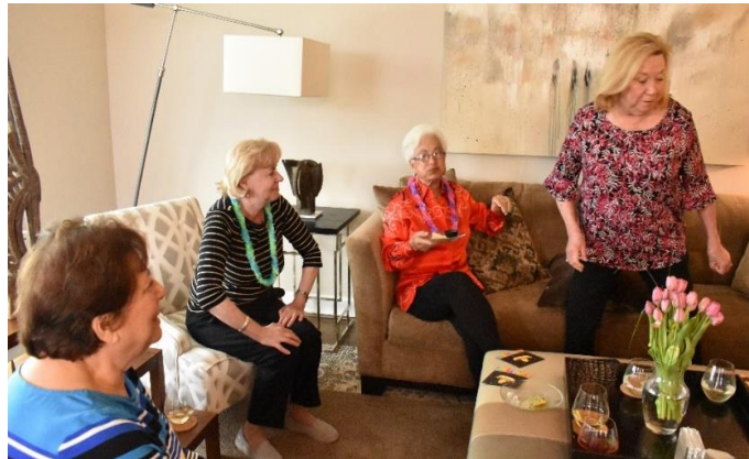
“Shall we let them out?”