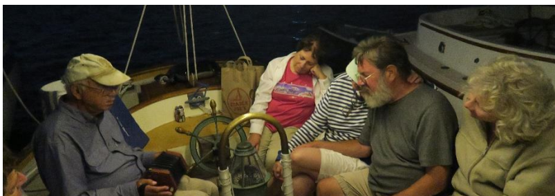
“Maybe it’s ten o’clock somewhere”