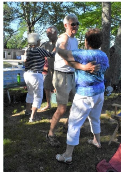
Dancing with the Stars