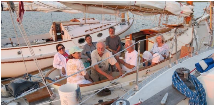
“It’s five o’clock somewhere”