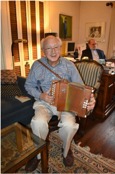
Host “Baggy Wrinkle”