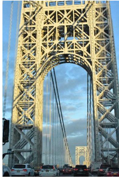
Heading home over the George Washington Bridge at sunset