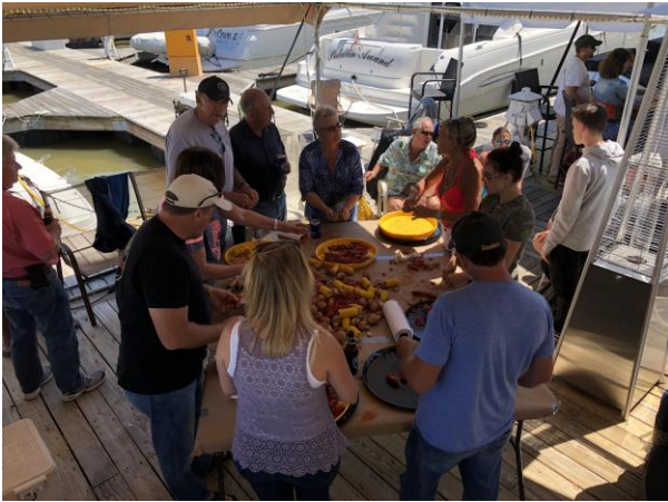
Eating "Mud Bugs"