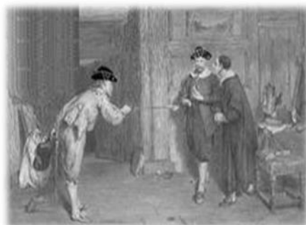
Staying 6' apart

New York Brothers usually meet at each other’s homes on a monthly, plus or minus, basis. Recently, this has not been safe or feasible. We turned to technology to continue our tradition virtually and even increase the frequency of our Zafs.