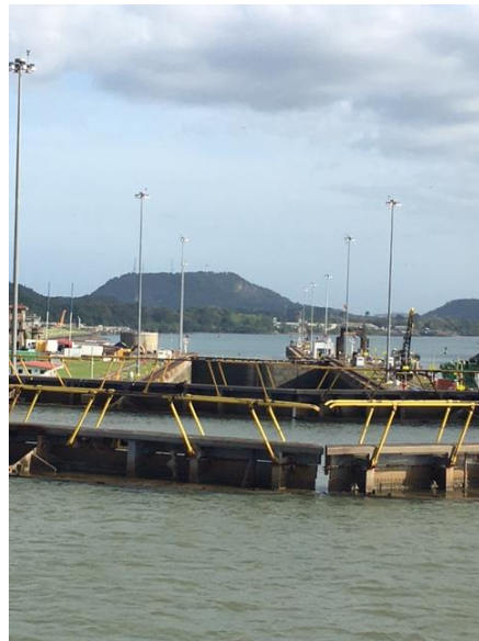
One of the last locks on the Pacific side