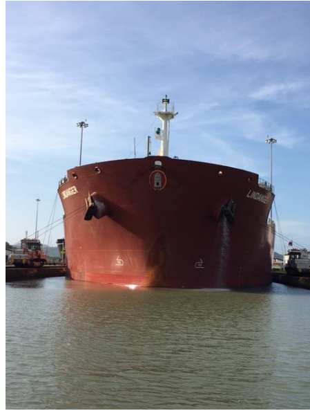
A bit weird to have a ship coming up behind you in a lock