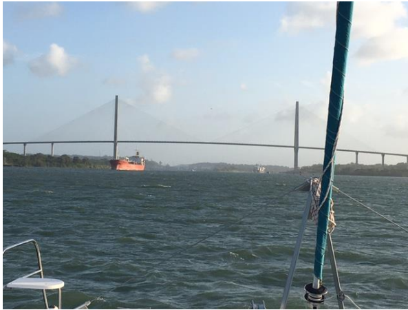
Heading under the Colon bridge to the Gatun Locks