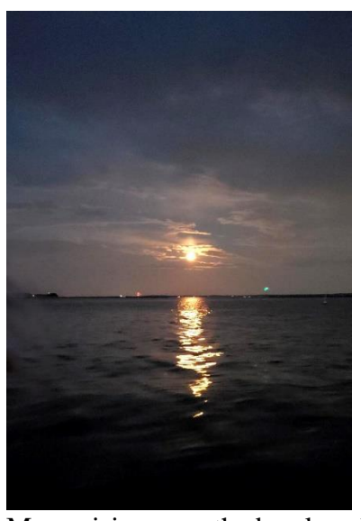
Moon rising over the break wall Entrance to Stamford Harbor.