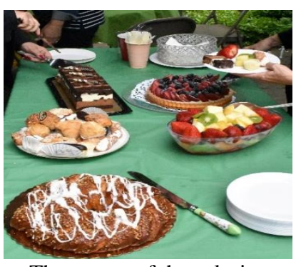
The source of the calories