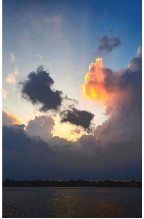
As it is typical this time of the year the afternoon brings out the thunderheads.