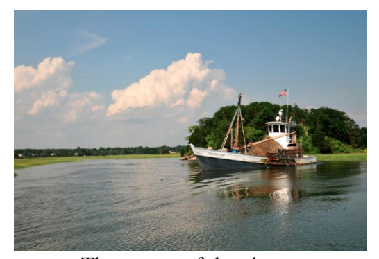
The source of the clams.

Joe Citarella provided generous choices of grilled sausages and chicken. Lenny and Miriam provided music.