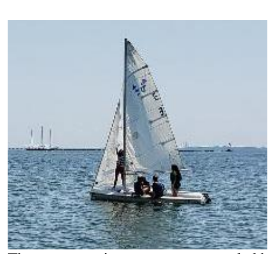
The next morning, we were serenaded by the Stamford Yacht girls racing in their 420. They had just won their race and were very excited.